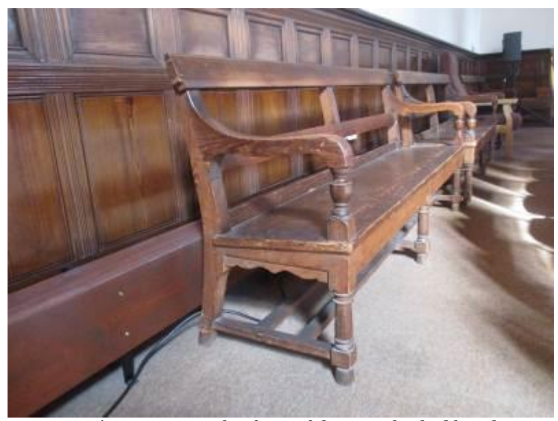
Figure 4: Example of one of the open-backed benches

The main meeting room (the former women's meeting room of 1884) contains open-backed pine benches with turned front legs and arms, which date from the nineteenth century.