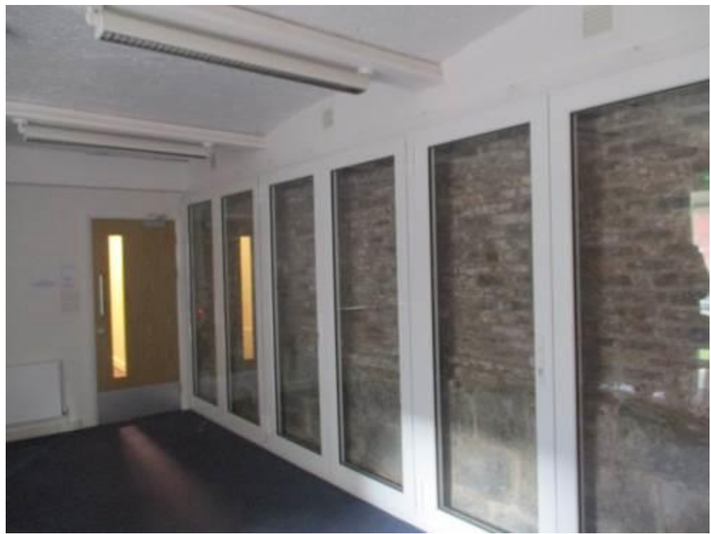
Figure 3: View of section of the former Friary located in the Woolman Room

Access to the lower ground floor and first floor is via the stairwell and lift to the south-west. All floors are light, pleasant and spacious and provide easy access to all rooms (which vary in size) and facilities. The lower ground floor rooms include Garden Room, the Fell room, archives office underneath the main meeting room, kitchen and toilet facilities. The Woolman room has a brick vaulted ceiling and has been recently refurbished with glass panelling to one side revealing the former Friary walls. The first floor is part of the new 2013-15 extension, and includes four additional meeting rooms.