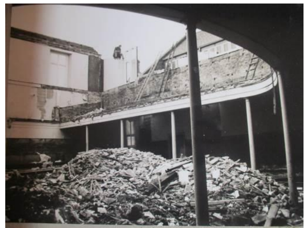
Figure 2: The former main meeting room (1817) being demolished in the 1970s

The architects Jones, Stocks and Partners were appointed to design a new building to accommodate a new spacious foyer, committee rooms, library, kitchen and toilets. The entrance of the building was altered and was relocated to Friargate, with a glass front incorporating cast iron columns from the 1817 large meeting room to carry the external canopy. From the late 1970s, the former women's meeting room of 1884 was used for worship, and the building fronting Clifford Street was no longer in Quaker ownership. Following this work, the Woolman Room and the associated toilets and kitchen were introduced using what had once been the crypt store of the original meeting house, designed by John Baily.